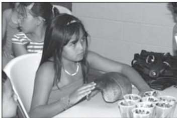
One camper gets to see what an armadillo shell feels like.