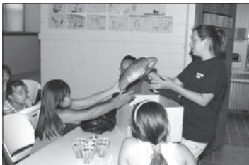
A Y camp counselor begins a science class with animal shells.