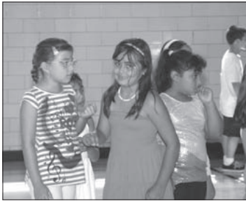
East Boston YMCA summer campers play freeze dance at the Y's new facility at 54 Ashley St.