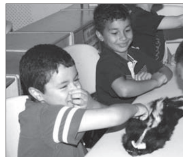
Campers think the skunk fur still stinks!