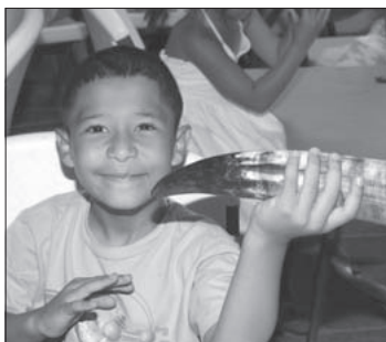
Camper with a bull horn.