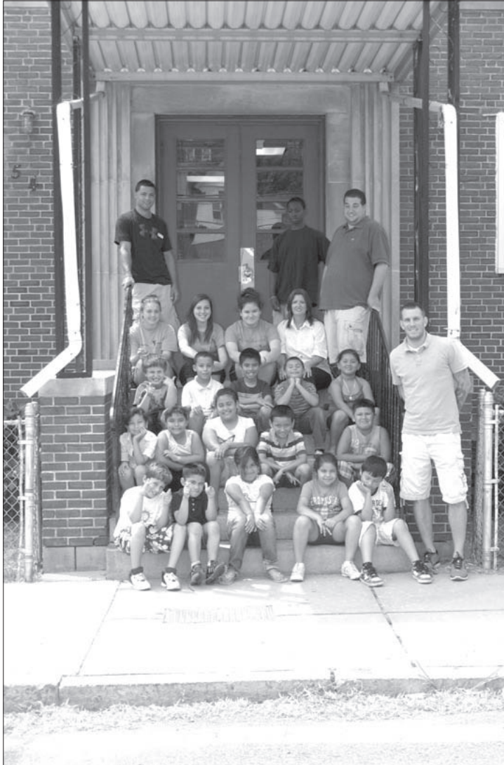
East Boston YMCA campers and staff outside their new location on Ashley Street.

"The building will be staffed by the Y and held to the same standards of operation as Bremen Street, with all instruction provided by trained and certified YMCA employees," said Cuzzi. "Your current membership card will allow you access to Ashley Street."